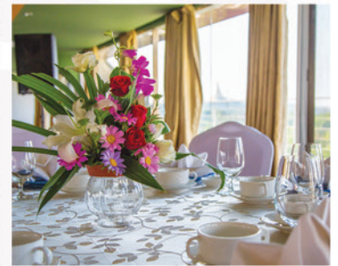
MEETINGS & EVENTS

Sit back, relax and entertain in our Veranda Bar – Yangon's combination of cool cocktail bar and business club. Relish in our list of bespoke cocktails, mixed with classic drinks and custom creations, made with the freshest ingredients and home-made infusions. Spend the evenings in indulgence, with live tunes from the piano and a delectable selection of bar foods and snacks – from cured meats and seafood, grilled skewers and barbecued wings, to vegetarian delights.