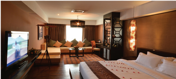
BAMBOO EXECUTIVE ROOM