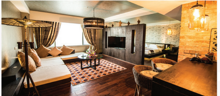
PADAUK BUSINESS SUITE

Because comfort is important, we take care of how the room spaces are treated. Notice the large windows that allow optimal light to stream in, lending your private space a brightly lit, yet warm and soft atmosphere.