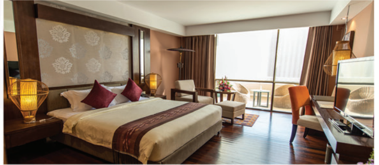
BALCONY DELUXE ROOM