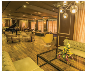
THE VERANDA COCKTAIL BAR

Following a day of non-stop meetings or sightseeing tours, unwind in The Portico Cafe and Lounge – the perfect place to enjoy panini, insalata, pizza, pasta, or biscotti from the counter, while appreciating the views and activities at our lobby.