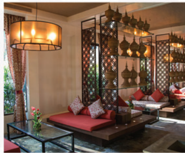
THE PORTICO CAFE & LOUNGE

Feast in a wide range of bistro offerings – from local Myanmar delights to international selection. Indulge yourself in our extravagant buffet, or simply make a choice off our a la carte menu. Enjoy breakfast, lunch and dinner in an open-style kitchen concept and setting. There's something for everyone at the Foyer Bistro. And our culinary team knows how to spoil you. Bon appetit.